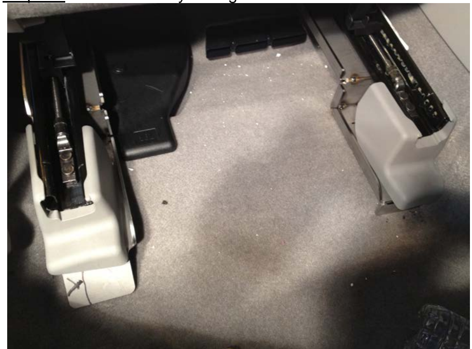
Step 13- Enjoy!

Step 12- Test the seat by sliding the seat back and forth.