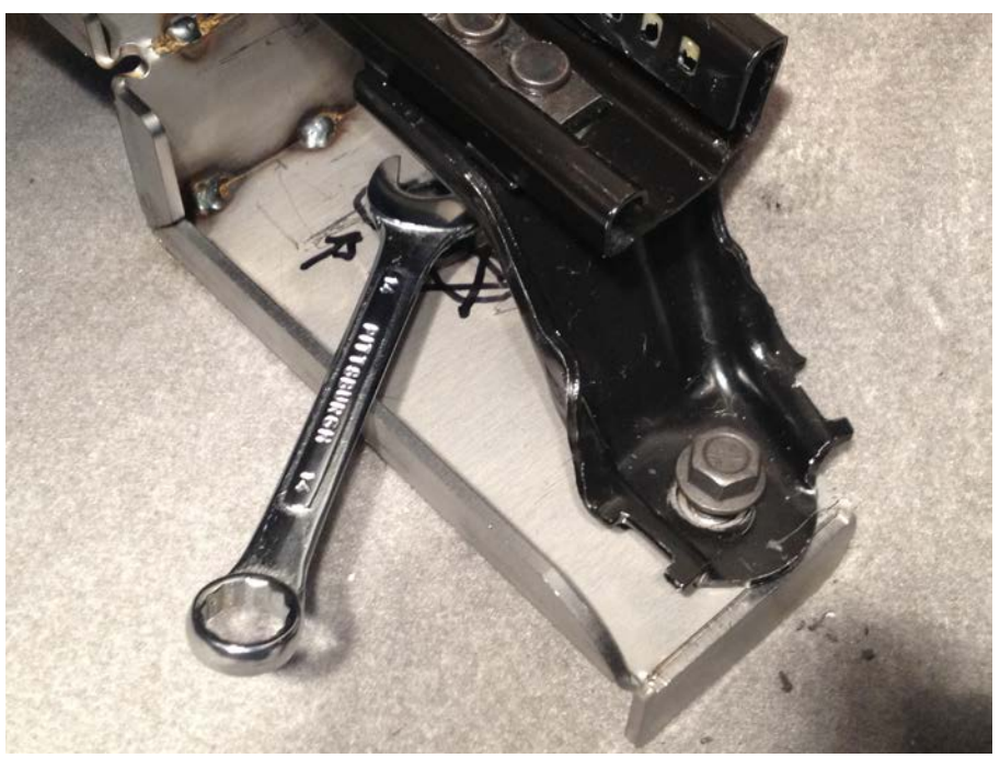
Step 11- Make sure all 8 bolts are tight.

Step 12- Test the seat by sliding the seat back and forth.