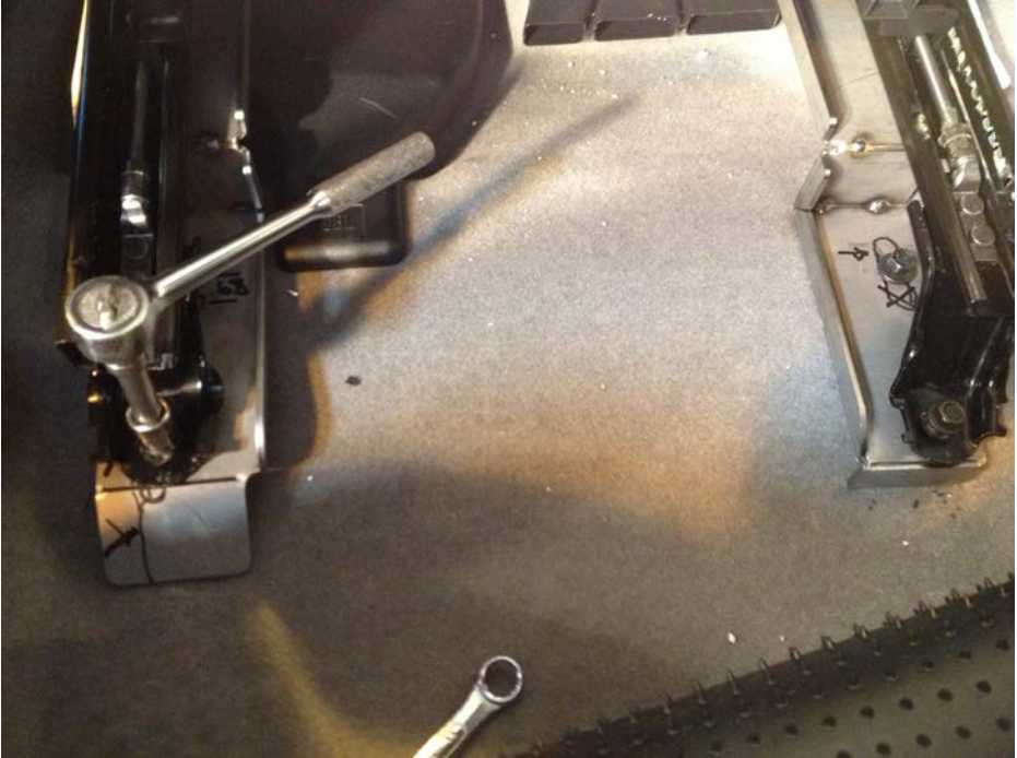
Step 10-Press seat lever and slide seat to the most up front position. Go to back seat and screw down secure the remaining 4 rear bolts.