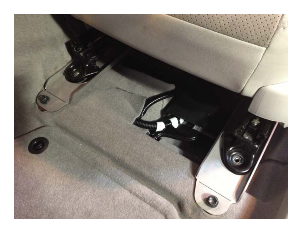
<u>Step 6-</u> In the front area; lay your factory seat on top of the EMS brackets and line up seat front holes with EMS front holes. Finger tighten front 2 feet with provided black EMS bolts.