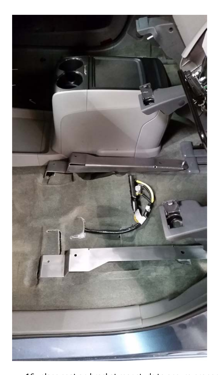
16. place seat on bracket rear studs to ensure proper bracket alignment