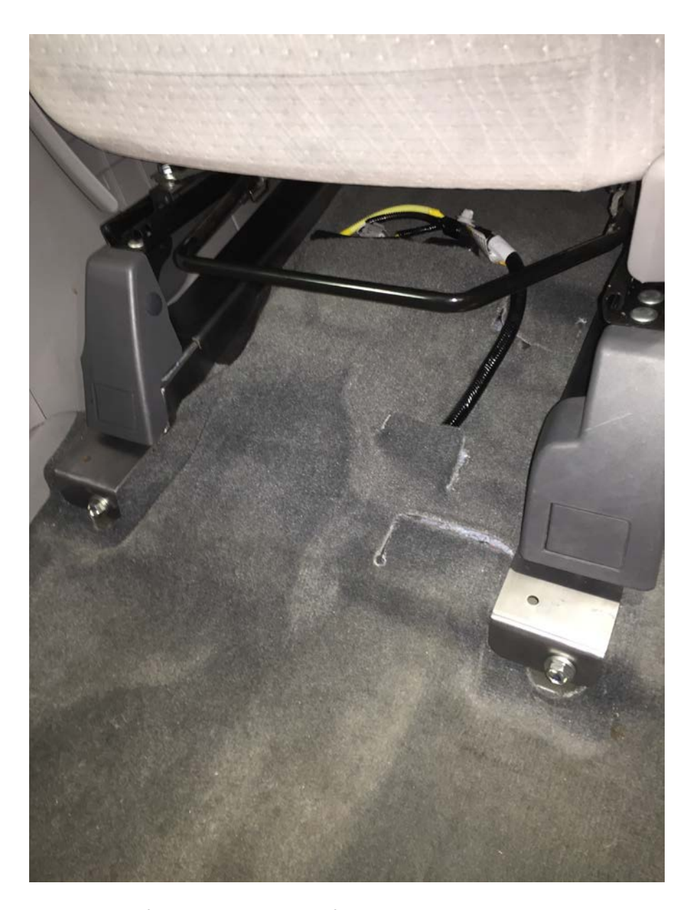
17. using factory bolts, place in front angled bracket hole