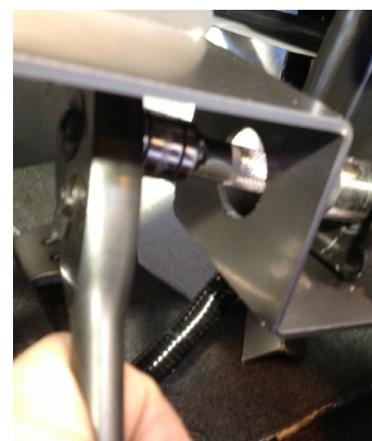
ExtendMySeat Front Outer View