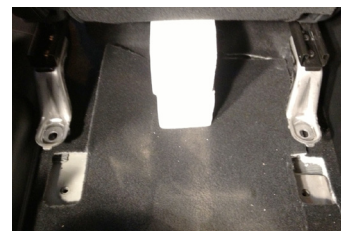
View from backseat showing carpet cutouts

Go to the backseat of the car to install the two rear ExtendMySeat brackets. Pull back the carpet floor mat. In order to lay down the ExtendMySeat rear brackets you will need to cut the carpet straight back from the factory hole location about 5-6" on both the inner and outer locations. Once the seat is installed, the carpet cutouts will be covered (see below photos).