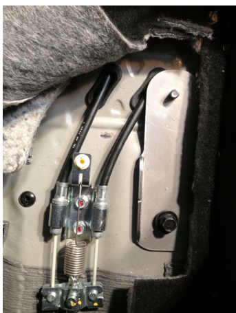
ExtendMySeat bracket secured