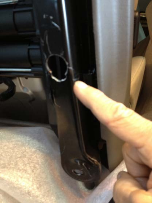
Photo of Hole in OEM chair rail.

Place the EMS brackets on the seat tracks to locate the drill location to make relief for the metal stud. You will need to drill a hole into your OEM seat rail so the metal stud can pass through. This will allow for the EMS brackets to secure correctly and flush. Once you drill the proper hole into the seat rail, you will be able to secure the EMS bracket to the seat chair.