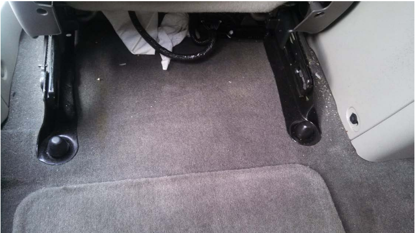
Photo of Rear Seat View

Step 3 - Move to the backseat and remove the two plastic guards. Locate and remove the two rear factory bolts.