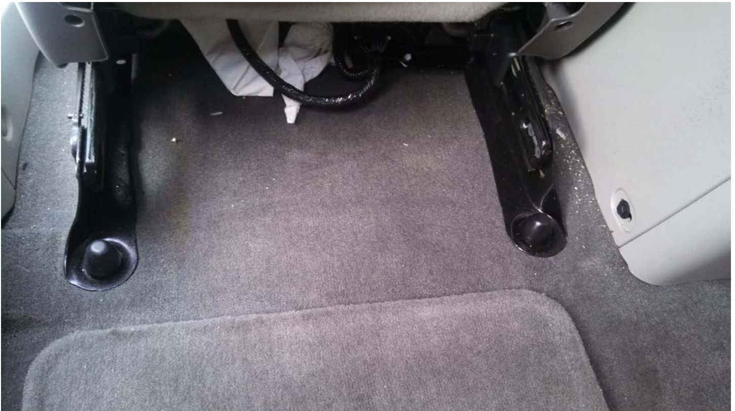
Photo of Rear Seat View

Step 3 - Move to the backseat and remove the two plastic guards. Locate and remove the two rear factory bolts.