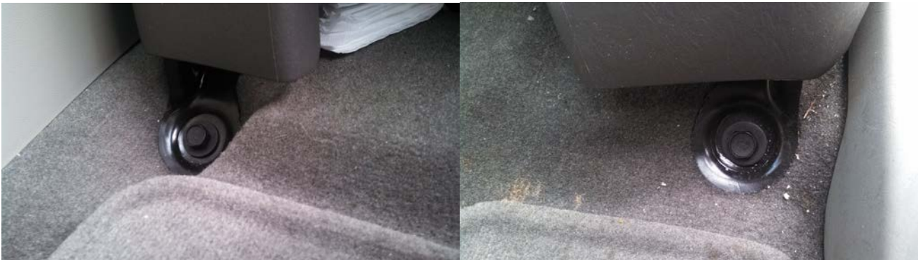
Photos of Front Seat View

Step 2- Use a socket wrench to remove the two factory bolts below the front drivers seat then slide your seat all the way forward.